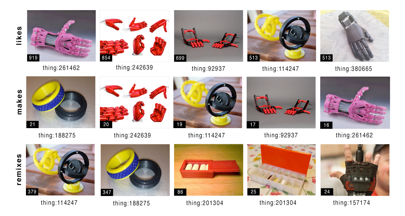
Figure 3. Overview of the top 5 items with respect to likes (top row), makes (middle row), and remixes (bottom row) among the 363 AT designs identified. Likes accrue when account holders click the "Like" button on a design profile. Makes accrue when an account holder clicks the "I made one" button on the design profile to indicate having made a copy. Remixes accrue when account holders click the "Remix it" button on a design profile. This figure illustrates the popularity of prosthetic hands and pillboxes in our dataset. All counts are publicly viewable on Thingiverse.com and were gathered August 2014.

This perceived popularity may be due in part to media coverage of open-sourced prosthetics resources.