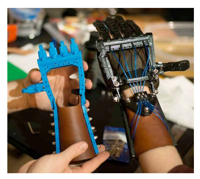
Figure 1. An example of a 3D-printable prosthetic hand, a popular type of assistive technology featured on Thingiverse.com. (Thing # 229620)

CHI 2015, April 18 - 23 2015, Seoul, Republic of Korea Copyright 2015 ACM 978-1-4503-3145-6/15/04...$15.00 http://dx.doi.org/10.1145/2702123.2702525