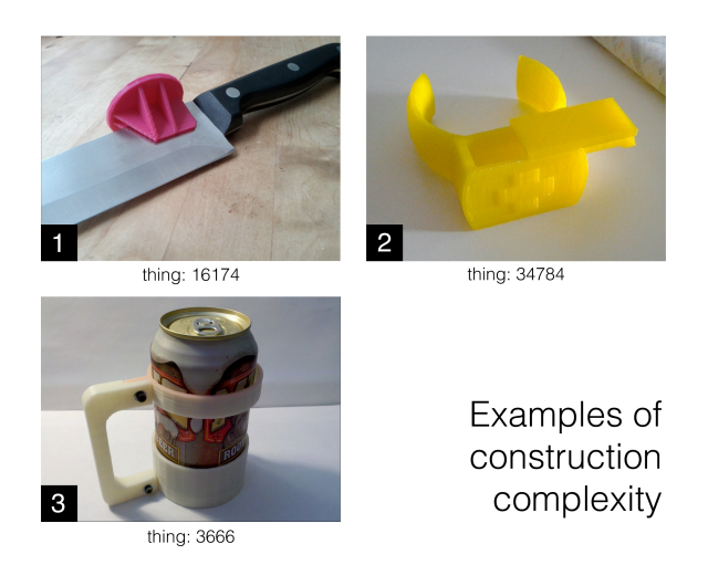
Figure 4. Example items with different construction requirements: 1) knife assistant for limited dexterity (no assembly required); 2) a wearable pill box (some assembly); and 3) cup holder (assembly and extra parts).

Table 2. Summary of assistive technology items currently on Thingiverse broken down by construction requirements.